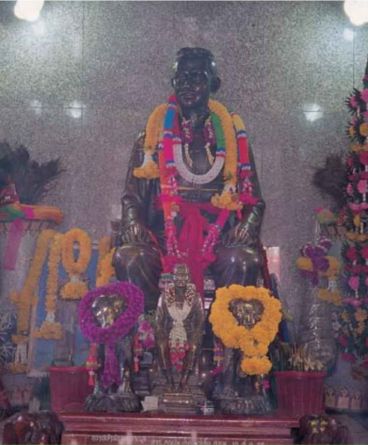
Chao Pho Phraya Lae Shrine