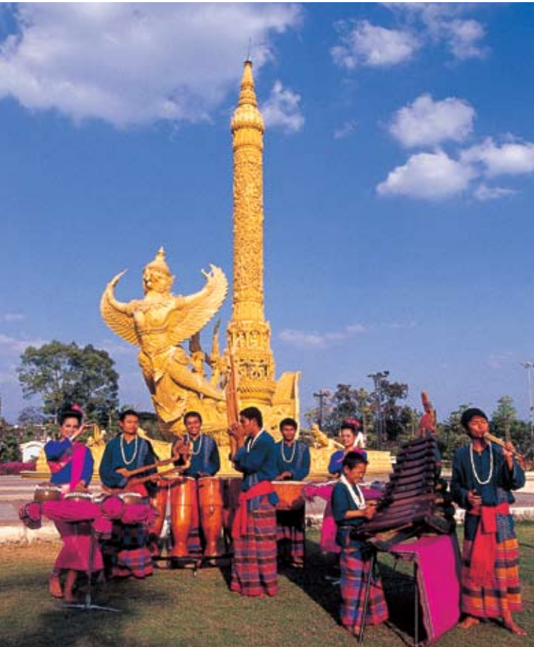
Candle Procession Festival