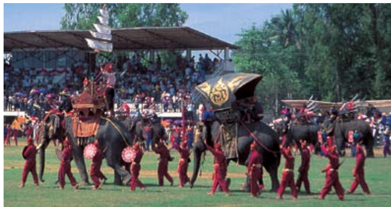
Surin Elephant Roundup

Trains depart from Bangkok's Hua Lamphong Railway Station to Surin daily. Tel: 1690, 0 2220 4334 Website: www.railway.co.th