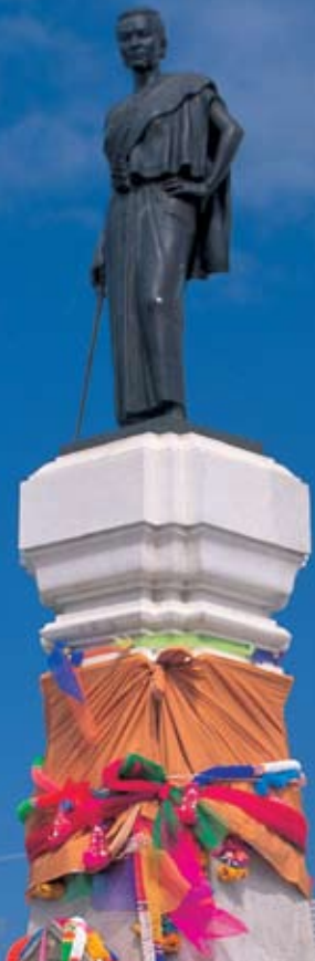
Thao Suranari Monument