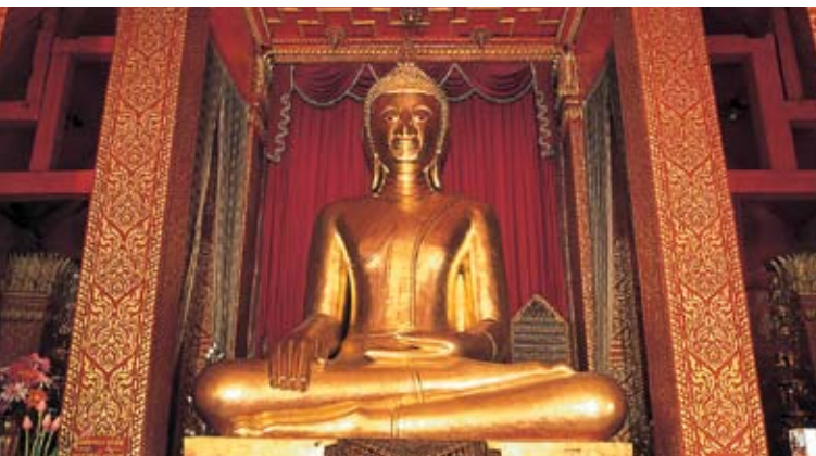
Wat Phra Lao Thep Nimit