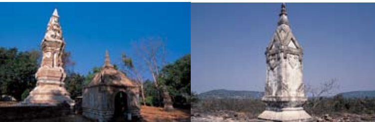
Phrathat Kong Khao Noi