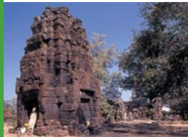
Tat Ton National Park