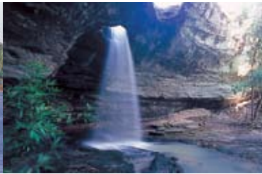
Pha Taem National Park