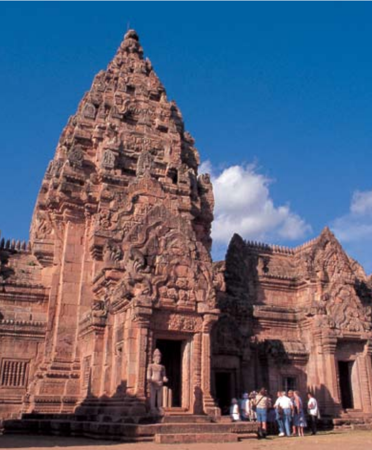
Phanom Rung Historical Park