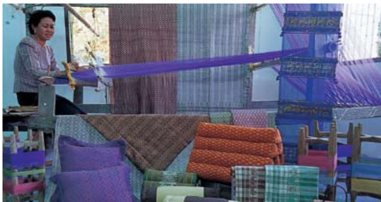
Ban Kham Phra Handicraft Centre

Thai Airways International flies from Bangkok to Ubon Ratchathani, which is 75 km. from Amnat Charoen. Tel: 1566, 0 2628 2000 Website: www.thaiairways.com