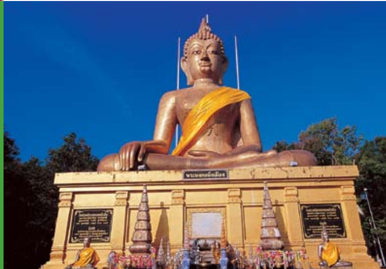
Phra Mongkhon Ming Mueang

The temple, 40 km. from Amnat Charoen town, has a Lanna-style chapel that enshrines an 18 th - century Buddha statue that, with its blend of Lanna and Lao influences, is considered one of the most beautiful images in the Northeast.