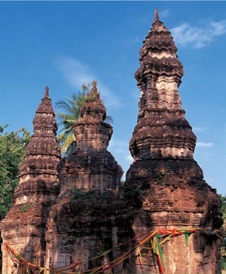
Prasat Ban Prasat