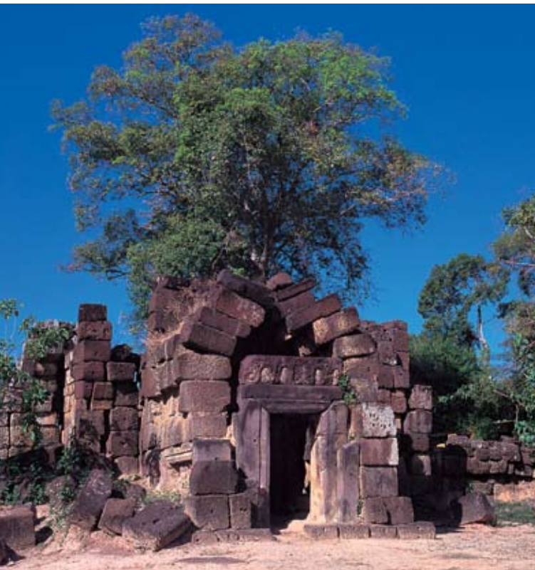
Temple of Ruins Preah Vihear

Held at the Somdet Phra Srinagarindra Park when the Lamduan flowers are in full bloom, the festival includes cultural performances by four different ethnic groups: the Khmer, Suai, Lao, and Yoe, a light-and-sound presentation about the city's founding, and handicraft sales.