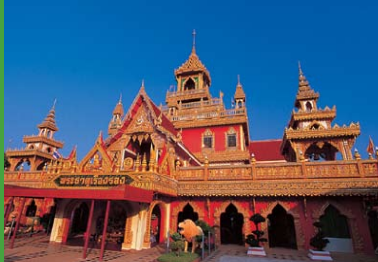
Phrathat Rueng Rong

Located 8 km. from town on Si Sa Ket-Yang Chum Noi Road, the site has a traditional design and is used for religious ceremonies. There is also a museum with cultural displays relating to I-san's ethnic minorities such as the Lao, Khmer, Suai, and Yoe.