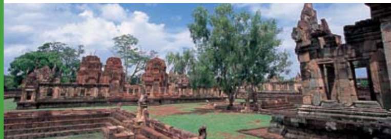
Prasat Hin Mueang Tam

Located near the foot of the hill of Phanom Rung are the Khmer ruins of Mueang Tam. With 10 th -century foundations, the small square sanctuary comprises a central building surrounded by four smaller towers, while in the four corners are ceremonial L-shaped ponds. The site is also rich in carved stonework.