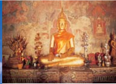
Wat Thung Si Mueang

...the province is known for its strong Buddhist tradition, and distinctive folk culture witnessed especially in the local cuisine, handicrafts and traditional events such as the annual Candle Festival.