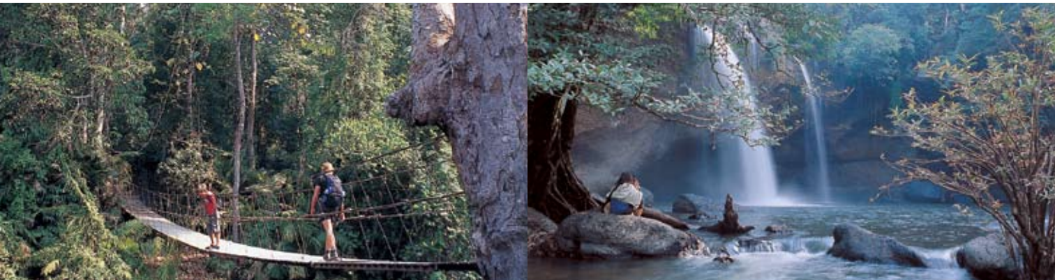
Khao Yai National Park

Located 58 km. southwest of Nakhon Ratchasima, off Highway 2, the cave (actually a series of rock formations) is famous for its prehistoric rock paintings, with figures of people and animals drawn in coarse red paint. It is believed that an agrarian community inhabited the area some 3,000-4,000 years ago.