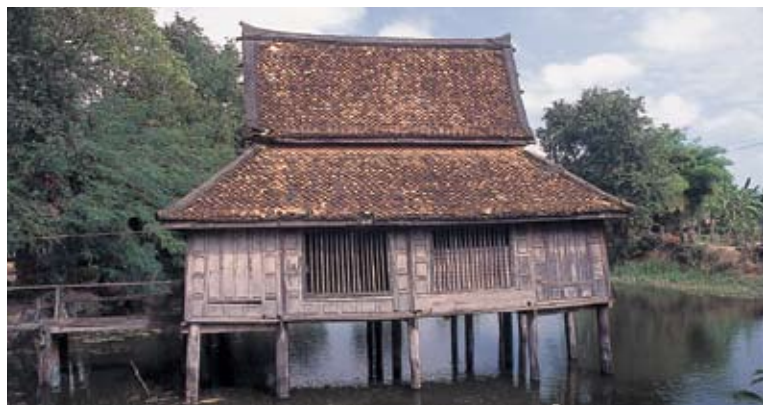
Wat Na Phrathat

Several centres related to agricultural production are open to the public to offer opportunities for special interest agro-tours. Among the top options are: The National Maize and Wheat Research Centre (Suwan Farm) Tel: 0 4436 1770-4 in Tambon Klang Dong, Amphoe Pak Chong; Chok Chai Farm Tel: 0 4436 1173 ext. 116, one of the largest dairy farms in Asia located on Mittraphap-Pak Chong Road at Km. 159; Mueang Phon Flower Garden Tel: 0 4432 3263 on Highway 2 about 60 km. from the city; and Grape Farms which can be found throughout Nakhon Ratchasima, particularly in Amphoe Pak Thong Chai and Amphoe Pak Chong.