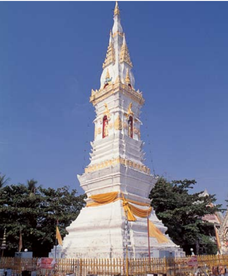
Phrathat Anon, Wat Mahathat