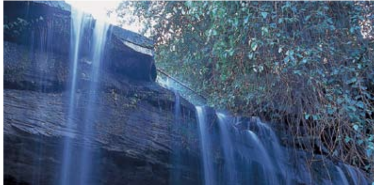
Namtok Samrong Kiat and Namtok Huai Chan