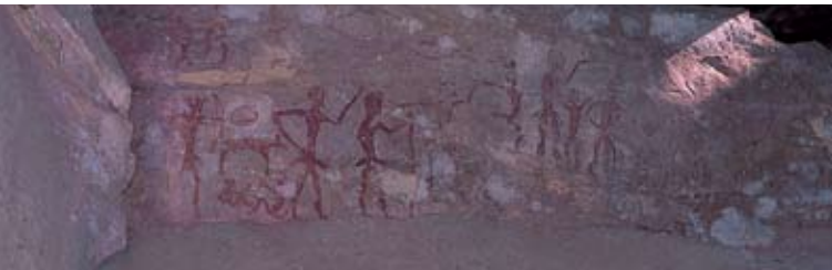
Tham Khao Chan Ngam