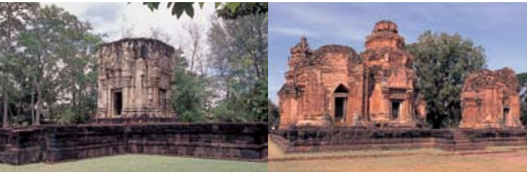
Prasat Hin Ban Phluang