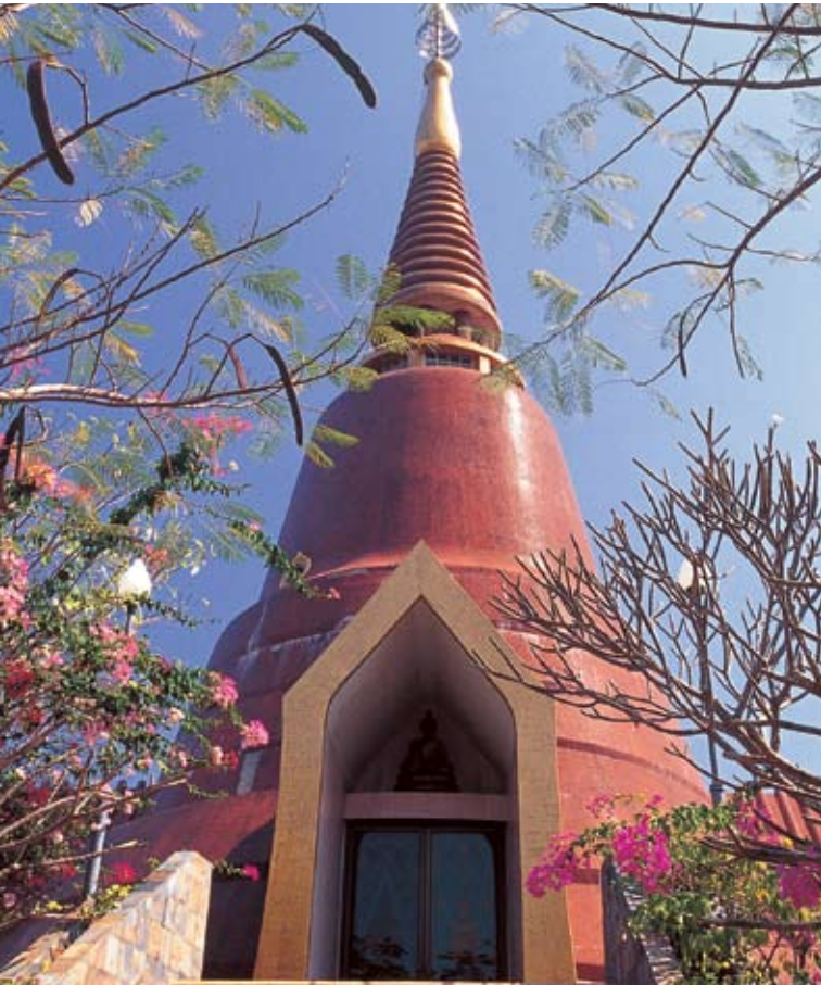
Wat Tham Saeng Phet