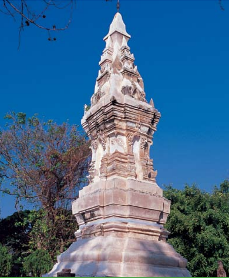
Phrathat Kong Khao Noi, Yasothon