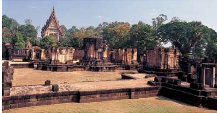
Prasat Hin Wat Sa Kamphaeng Yai