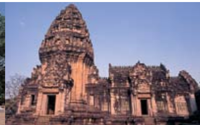
Phimai Historical Park