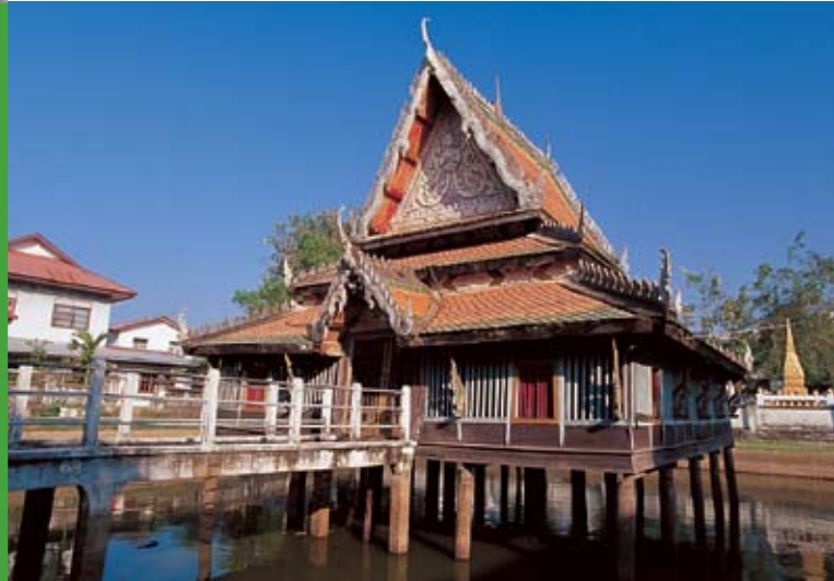
Scripture Hall, Wat Mahathat

A popular local picnic spot, this 2-km. natural beach is formed by the receding level of the river during the dry season.