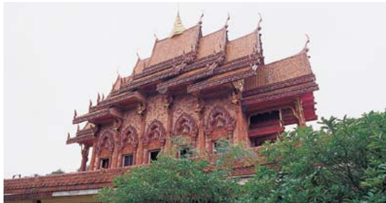
Wat Phukhao Kaeo

Reached via Highway 2222, the 20,000 acre national park contains interesting rock formations and waterfalls, notably the attractive Kaeng Tana cataract.