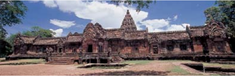
Phanom Rung Historical Park