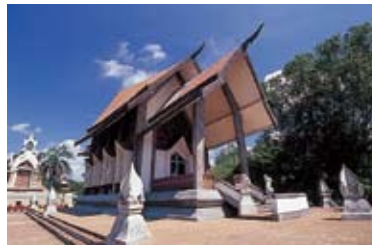
Wat Sala Loi

In the northeast of the city, 500 metres from Rop Mueang Road, the temple is most notable for its preaching hall designed in the shape of a sailing junk, which was awarded the prize as the best avant-garde religious building from the Siam Architects Society in 1973. Enshrined here is a large standing white Buddha image. On the front of the door is a plaster sculpture of Thao Suranari sitting and praying in the middle of a pond.