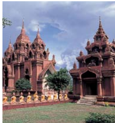
Khao Phanom Rung Fair